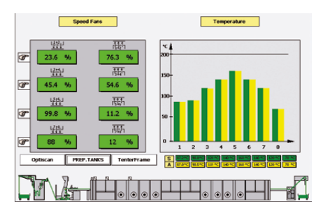
Visualization stenter frame