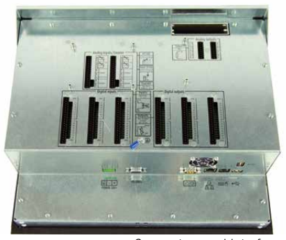
Connectors and interfaces