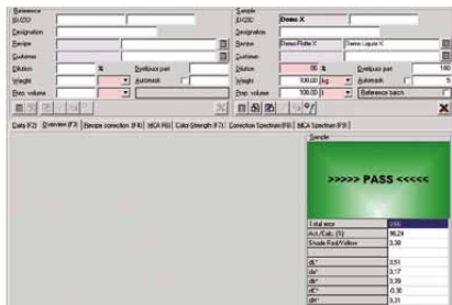
Check of a dye liquor

Our selection of hardware reflects well-known industrial standards in PC and network technology in addition to the highly efficient, robust and user-friendly top-of-the-line instrument of the leading manufacturer Agilent and Hamilton.